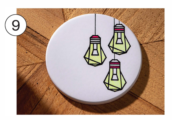
You did it!

CARE: Wash with warm water and glass cleaner. Do not use steel wool, colored cleansing agents, or scrubbing pads.