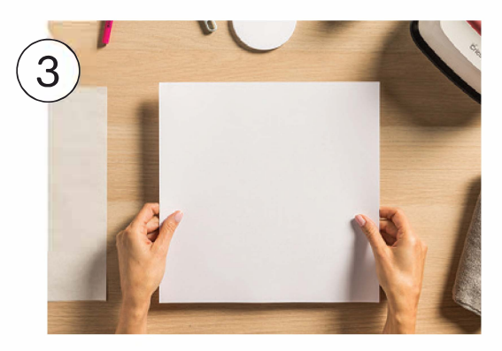
Cover Cricut EasyPress Mat with cardstock to protect it from unwanted transfer.