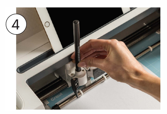
Insert Infusible Ink Pen or Marker into Clamp A, load mat into machine, then press flashing Go button.

Tip: If you have assigned multiple pen colors to your design, Design Space will prompt you to load specific colors at specific times.