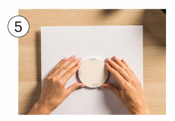
Place item on cardstock.