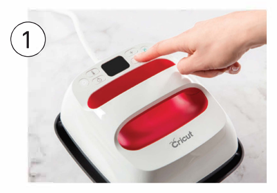
For this project, set EasyPress to 400°F and 240 seconds.

Tip: For precise temp, time, and pressure settings for your project, always refer to the Cricut EasyPress Heat Transfer Guide at cricut.com/heatguide.