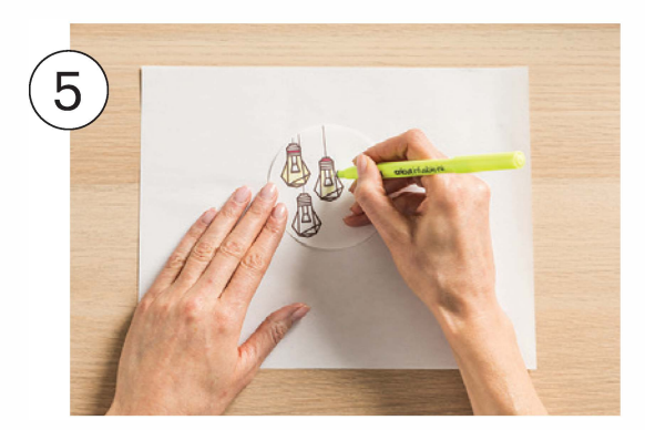
Once the design is complete, unload your mat from the machine. Remove your design from the mat and, if desired, color it in using Infusible Ink Markers or Pens.

Tip: To ensure the ink does not bleed through onto your surface, place a second sheet of paper beneath your design before coloring.