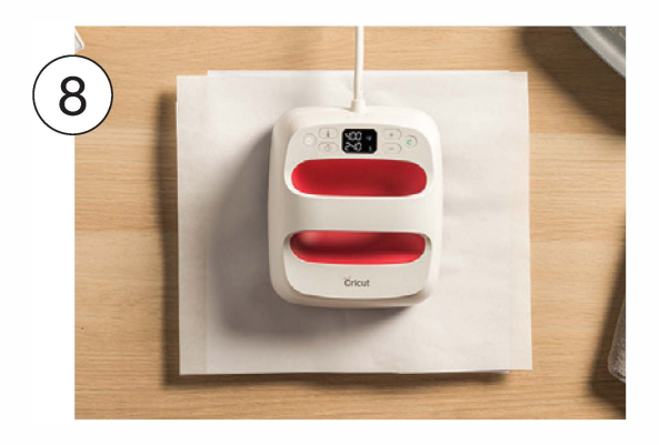
When beep sounds, slowly lift press. Try not to move the stack, including butcher paper. CAUTION: Item will be very hot. Let cool completely before handling.