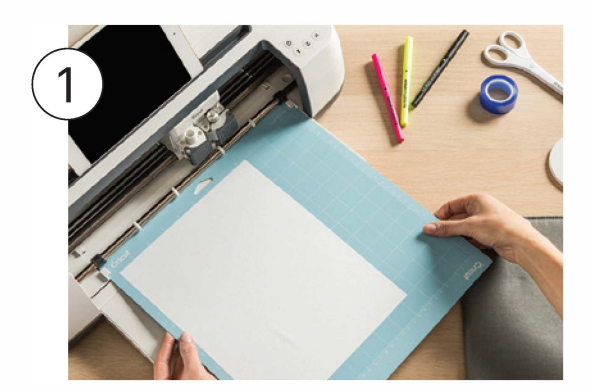
Place sheet of copy paper onto a LightGrip Machine Mat.