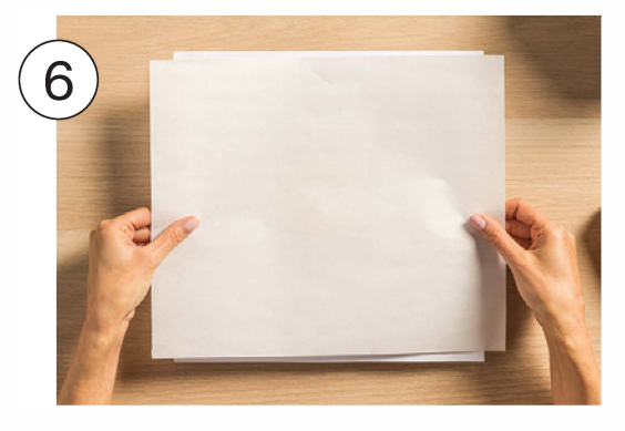
Cover item with butcher paper.