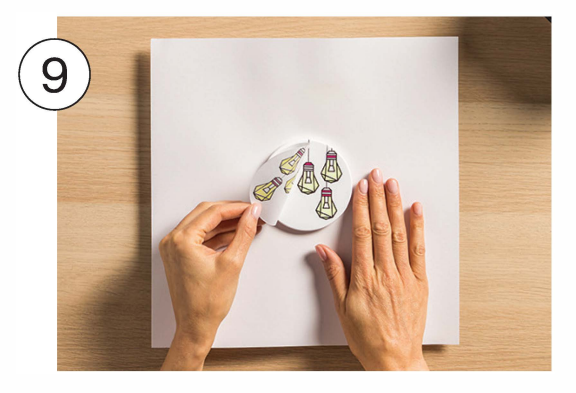
Slowly remove butcher paper, tape, and design. Tip: Never reuse butcher paper for another project.