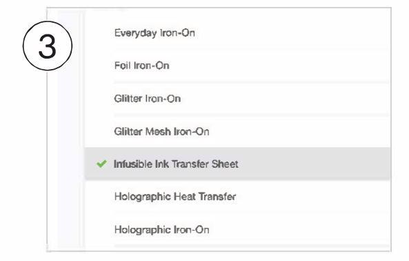
Click the Make It button. Select Browse all materials, then Infusible Ink Transfer Sheet.