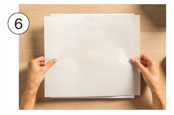
Cover item with butcher paper.