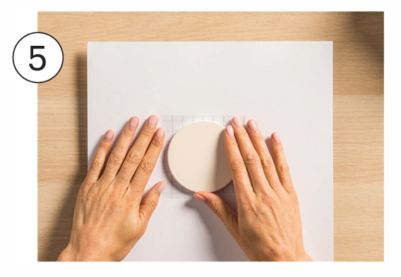
Place item on cardstock.