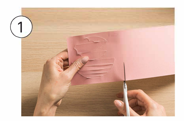
Remove cut design from mat and trim away unused area of sheet.