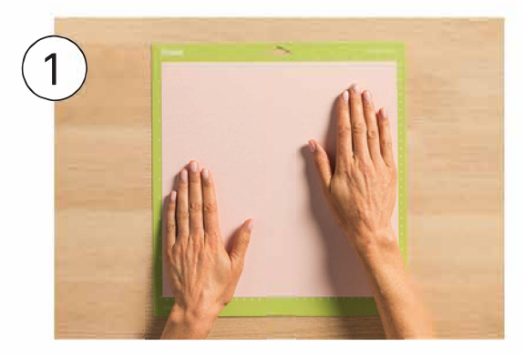
Place Infusible Ink Transfer Sheet onto StandardGrip Mat, shiny liner side down.