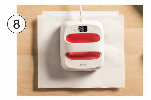
When beep sounds, slowly lift press. Try not to move the stack, including butcher paper. CAUTION: Item will be very hot. Let cool completely before handling.