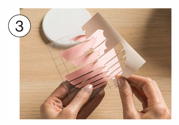
Use your fingers or tweezers to carefully remove the negative pieces from in and around your design, leaving design on liner.