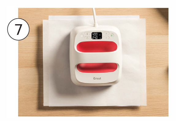
Press at 400° F for 240 seconds. Press the green C button to start the timer countdown.