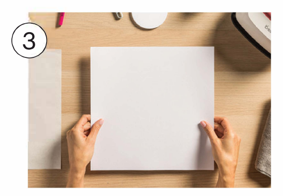
Cover Cricut EasyPress Mat with cardstock to protect it from unwanted transfer.