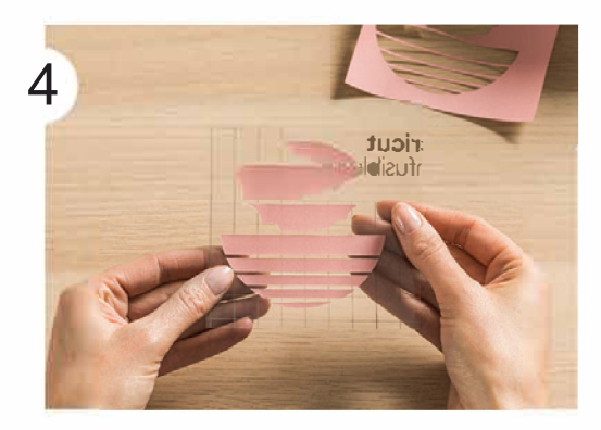
Trim clear liner so it does not extend beyond Cricut EasyPress heat plate.