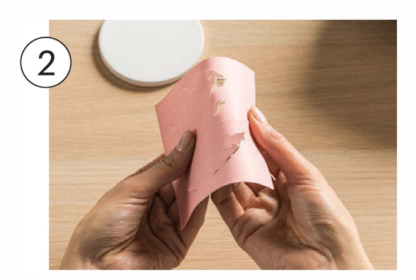
Gently roll cut design so cut lines separate and are more visible. "Cracking" the cut this way makes it easier to remove excess paper from in and around your design.