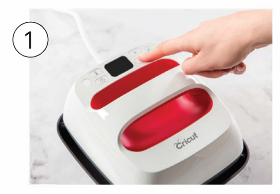
For this project, set EasyPress to 400° F and 240 seconds.

Tip: For precise temp, time, and pressure settings for your project, always refer to the Cricut EasyPress Heat Transfer Guide at cricut.com/heatguide.