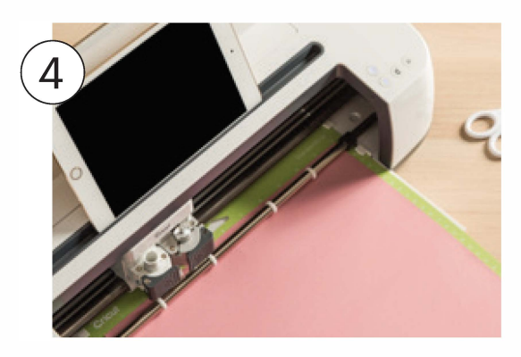
Load mat and blade into machine, then press flashing Go button.