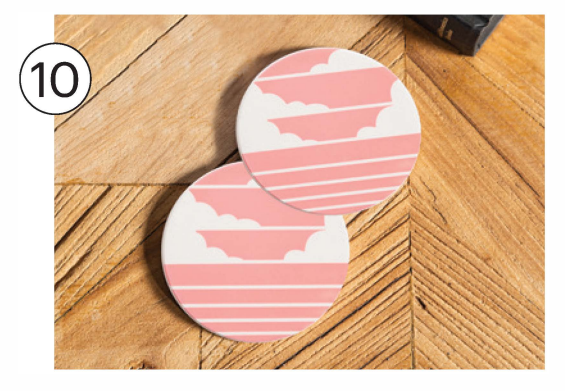
You did it!

CARE: Wash with warm water and glass cleaner. Do not use steel wool, colored cleansing agents, or scrubbing pads.