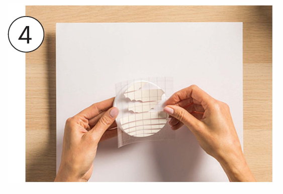
Place design face down on item, clear liner on top. If needed, use heat resistant tape to secure.