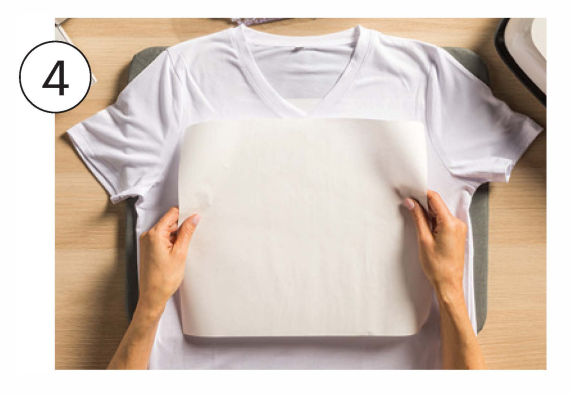
Cover item with butcher paper.