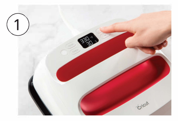
For this project, set EasyPress to 385° F for 15 seconds.

Tip: For precise temp, time, and pressure settings for your project, always refer to the Cricut EasyPress Heat Transfer Guide at cricut.com/heatguide.