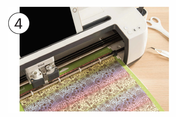
Load mat and blade into machine, then press flashing Go button.