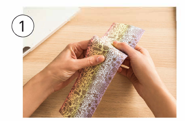
Remove cut design from mat and trim away unused area of sheet. Gently roll cut design so cut lines separate and are more visible. "Cracking" the cut this way makes it easier to remove excess paper from in and around your design.