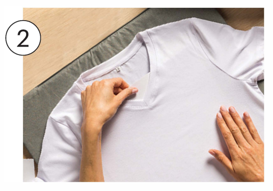
Place fabric item on top of Cricut EasyPress Mat. Position sheet of white cardstock inside item to protect your mat and project.

Tip: For precise temp, time, and pressure settings for your project, always refer to the Cricut EasyPress Heat Transfer Guide at cricut.com/heatguide.