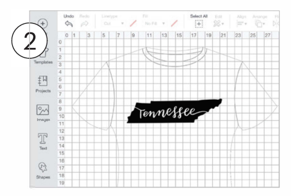
In Design Space, select and size your design to fit on your fabric item. Note: Be sure to Mirror your design.