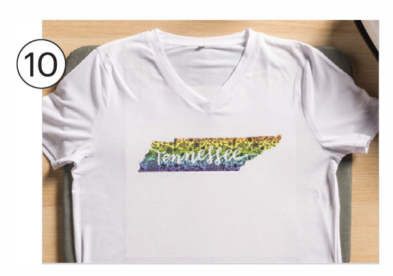
You did it!

Important: Do not move your hands or slide Cricut EasyPress during transfer. S tay still while pressing.