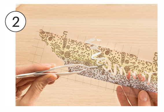
Use your fingers or tweezers to carefully remove the negative pieces from in and around your design, leaving design on liner. Trim clear liner so it does not extend beyond Cricut EasyPress heat plate.