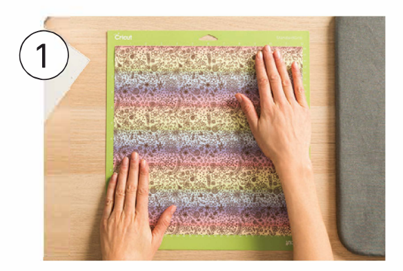
Place Infusible Ink Transfer Sheet onto StandardGrip Mat, shiny liner side down.