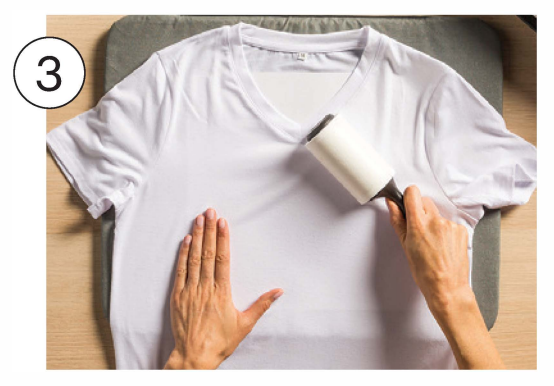
Do not skip this step: Use a fresh adhesive to lint roll the entire surface. Even small debris or fibers can cause imperfections in the final transfer.